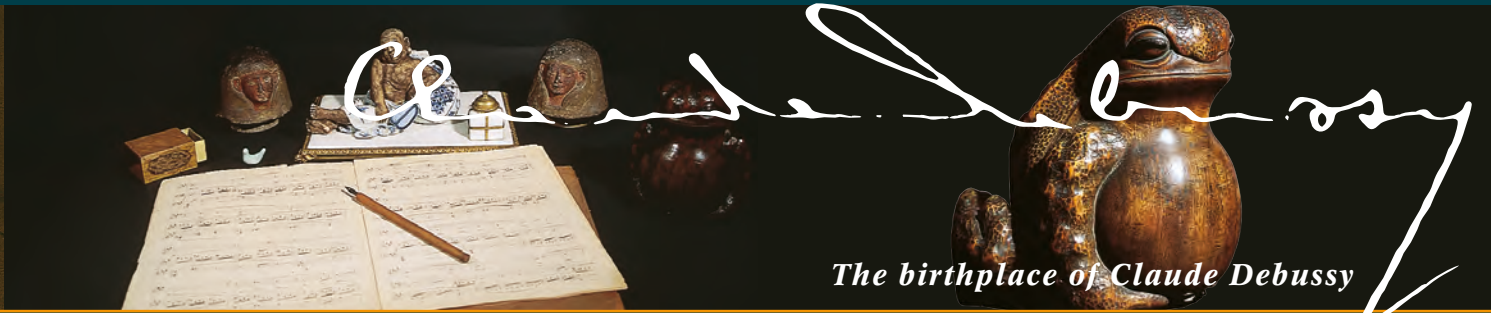
The birthplace of Claude Debussy